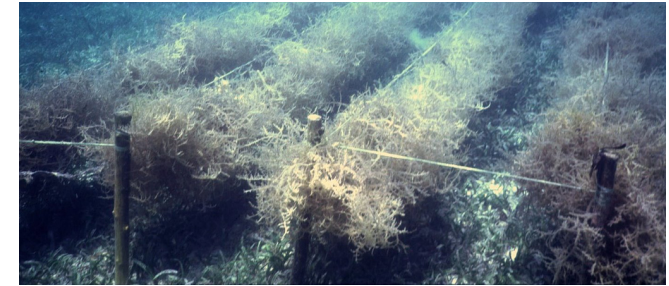
Figure 1. An algae farm in the Philippines, where the yield from a one-hectare farm can be as much as 48 tonnes in two months. In 2008 the Philippines harvested about 75 000 tonnes of seaweed.

The algae grown on this area of sea generates about 46 TWh/y of usable energy per year. It is possible that cultivation at such large levels requires the addition of nutrients to help the algae grow. Water movements mean that such nutrient additions cannot be contained, so there is a risk of causing uncontrolled algal blooms. These might increase greenhouse gas emissions through ammonia and nitrous oxide production.