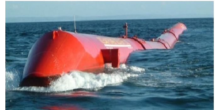
Figure 1. A Pelamis wave energy converter is a 'sea snake' made of four sections, each the size of a railway locomotive. It faces nose-on towards the incoming waves.

Level 4 assumes that the UK deploys the equivalent of around 27 000 Pelamis machines over a 900 km stretch, involving installing the full capacity north of Ireland as well as some off the south-west tip of Cornwall (see Figure 2). These machines are also assumed to be more efficient, delivering 10 kW per metre (25% of the waves' raw power). With a 90% availability, the total output of such wave farms is 71 TWh/y.