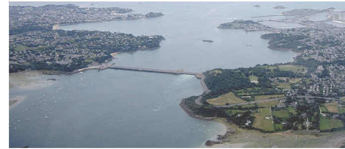
Figure 1. The La Rance tidal barrage in Brittany, France, has been operating since 1966, with a peak generation of 240 MW.

Level 4 assumes that 20 GW of tidal range capacity is built by 2050 with an enclosed water area of around 1400 km 2 , about the size of 64 La Rance schemes. This requires all of the UK's potential tidal range resource to be fully developed. The total electricity generated is 39 TWh/y in 2050.